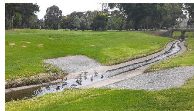
Many a ball was lost in this fast-flowing drain. It didn't deter the ducks though!

Anyone who attended the tournament at Yowani Country Club (ACT) was a happy chappy. We were able to play golf after weeks of not being able to in Sydney and other parts of NSW because of heavy rains and flooding.