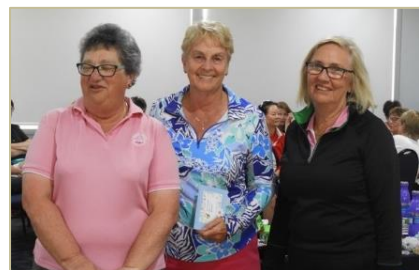
3rd place Roseville and Chatswood